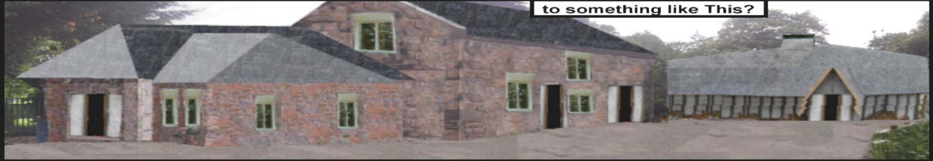
to something like This?

We Need Your Help A plan is afoot to restore / upgrade Elder Farm, especially the derelict B-Listed building / Fairfield Steadings, gifted to the people of Greater Govan by Lady Elder. Her concerns were the health and well-being of the community. The bottom line is that the building is in danger of being demolished and needs to be fixed. But what should be the end result? One or a Combination? Perhaps you have another idea to send us? Current options offered to us are :