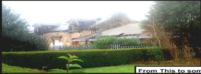
From This to something like This?